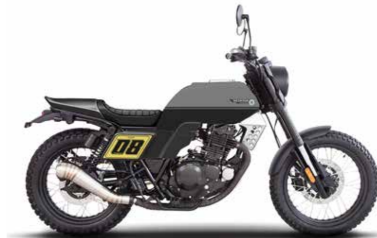
BACKSTAGE BLACK / TIMBERWOLF GREY

The inverted fork, adjustable stereo shock absorbers, KOSO LED indicators, ABS brakes and LED beams front and rear – the Felsberg FT has all the equipment you need to be at the top of the game.