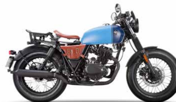
ROYAL BLUE MATT / HORIZON BLUE

Fitted with a branded leather bag on its side panel, this bike demands a rider who's unafraid to stand out. But the Rayburn 125 isn't just for show, its four-stroke air-cooled engine means business too.