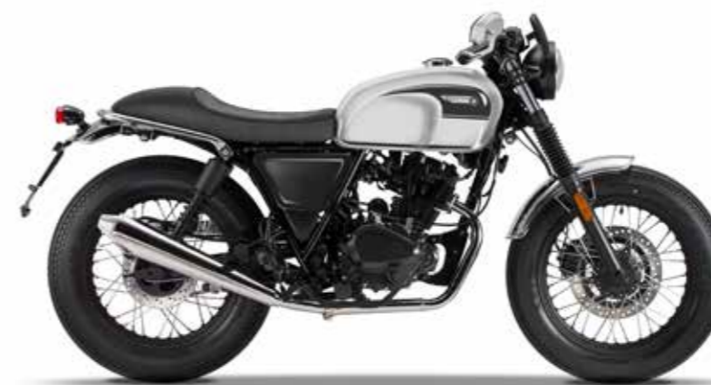
BULLET SILVER / BACKSTAGE BLACK

With LED lights, electronic fuel injection and a digital speedometer, the Sunray 125 rides the forefront of throwback. Disc brakes front and rear mean bulletproof stopping power. While the one-cylinder four-stroke, air-cooled engine provides all the hustle you need.