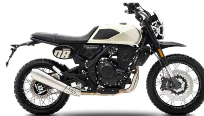
DESERT GOLD MATT

The range of Brixton's indestructible inline two-cylinder engine is significantly extended with the Crossfire 500 XC. Longer suspension travel, a 19-inch front wheel, higher handlebars, and Pirelli Scorpion Rally STR give the latest Crossfire 500 the reserves it needs to hold its own off-road. And there's much more: skid plate, crash bars and radiator grille are just as naturally already fitted as standard on the XC as the new cross-spoke rims, flat seat, black tank pads and raised mudguard. The surprising side effect of the new geometry: probably the best Crossfire handling on asphalt too. The new Brixton Crossfire 500 XC brings the middle class into top form.