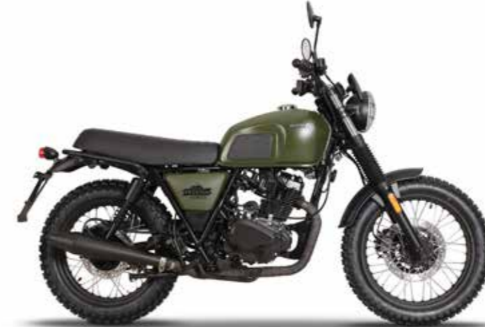
CARGO GREEN MATT