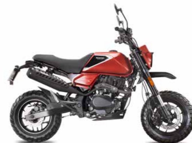
CLOCKWORK ORANGE MATT