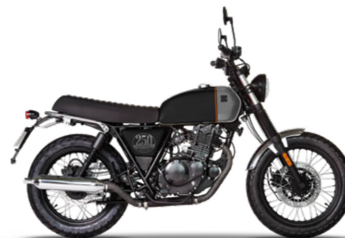
TITAN BLACK / STERLING GREY

KOSO LED indicators, LED beams front and rear plus, ABS brakes and adjustable rear shock absorbers as standard – the Cromwell 250 delivers all the specs that matter, so you can take on the road.