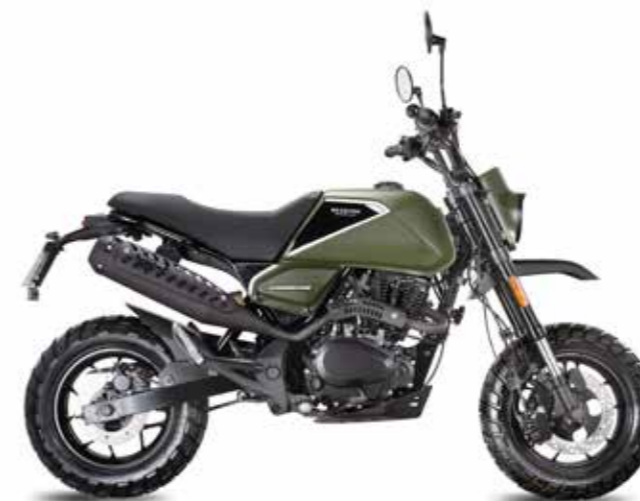
CARGO GREEN MATT

*according to Commission Delegated Regulation (EU) 134/2014, Annex VII