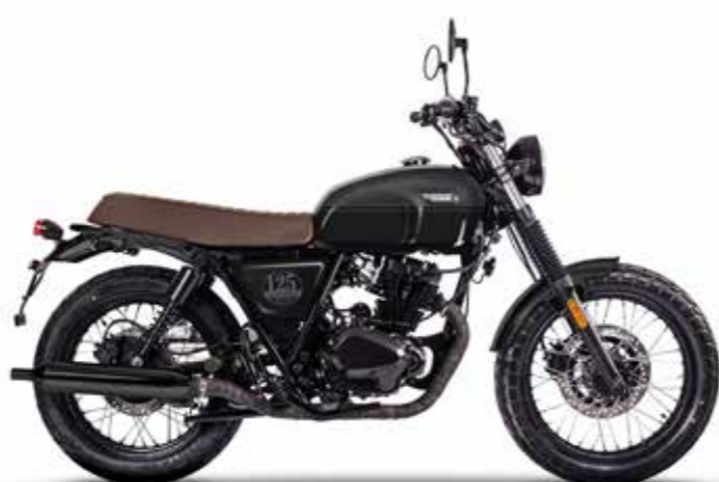
BACKSTAGE BLACK / TITAN BLACK