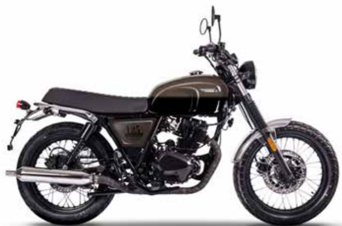
CHARLY BROWN / TITAN BLACK