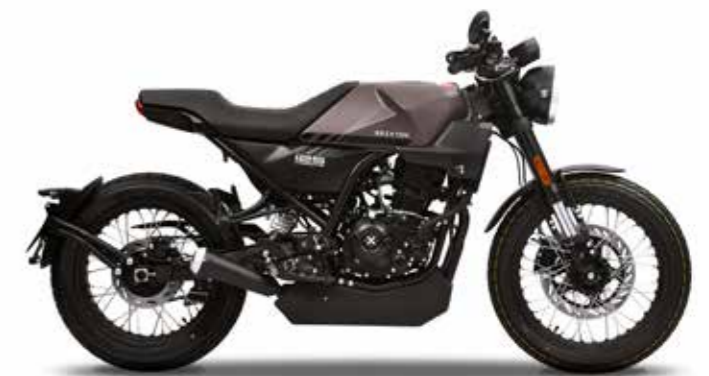
CHARLY BROWN MATT