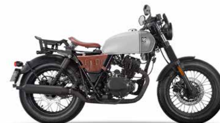
BULLET SILVER / TIMBERWOLF GREY