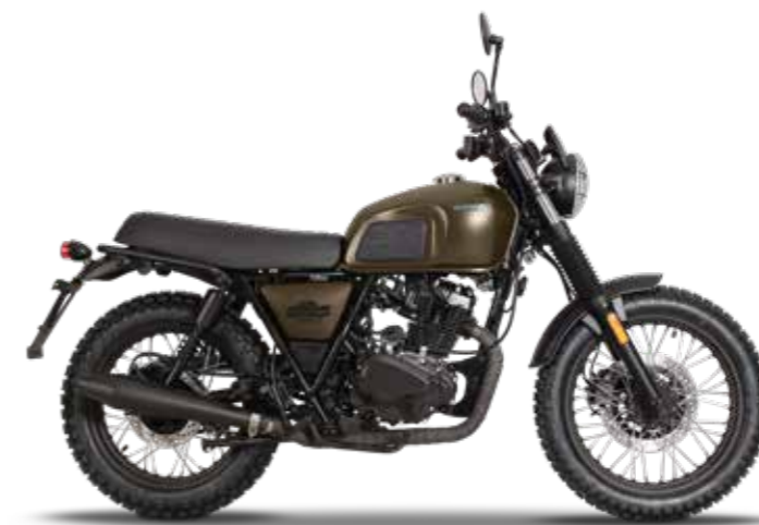
CHARLY BROWN MATT