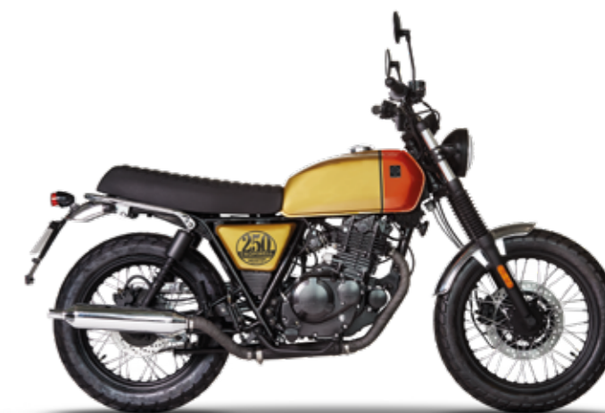
DESERT GOLD / CLOCKWORK ORANGE